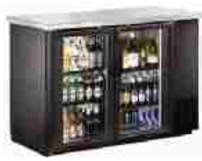
Side mounted Back Bar Cooler