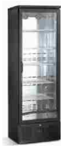
Slimline wine cooler(500mm depth)