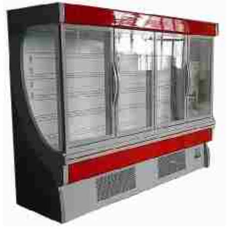
Upright Freezer L