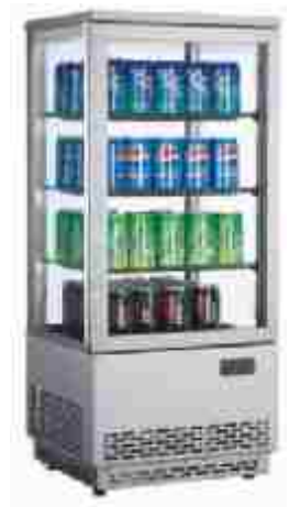
Stainless stell RT78L-8