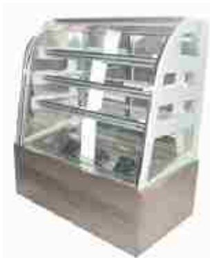
Three shelf single curve