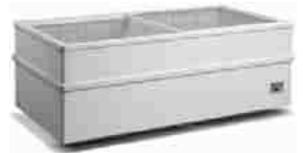
Jumbo Freezer SD580/780/980