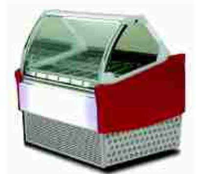
Ventilated Cooling ice cream