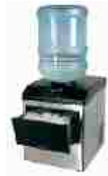
Bottle water ice maker