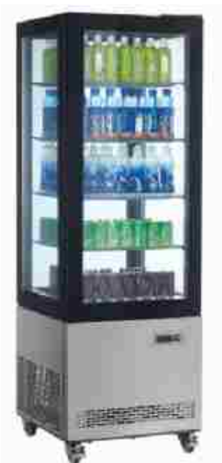
With light box