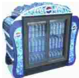
side and top rack