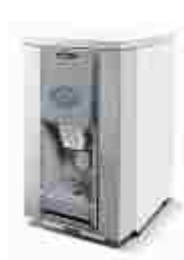
Ice dispenser ID25