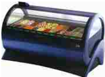
Ice cream Cabinet