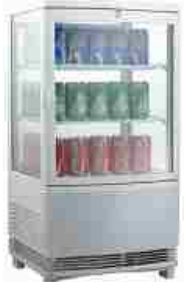
Curved glass door

All kinds of 4 sided glass cooler can custom-made.