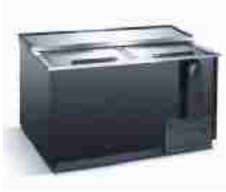
Bar bottle cooler