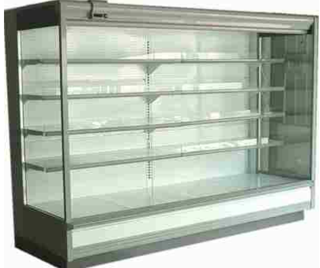
Texas (remote type)