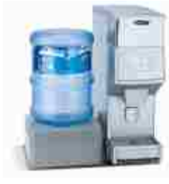
Ice dispenser ID12T