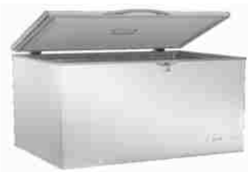
Europe Energy Class A+ or B 350/450/550/650L

Denmark standard dimensions optional to hold 6/8/10/12 ice cream barrels.