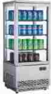
Stainless Steel finish