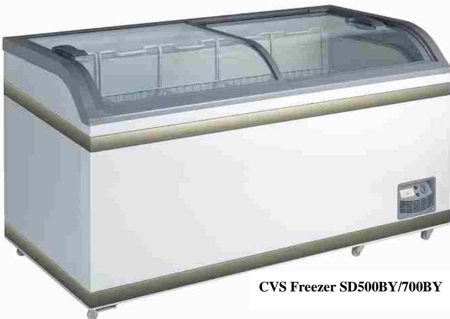
CVS Freezer SD500BY/700BY