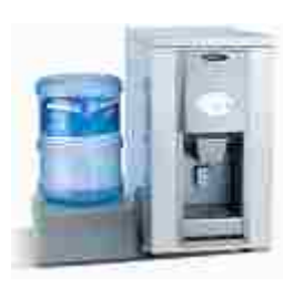
Ice dispenser ID12T