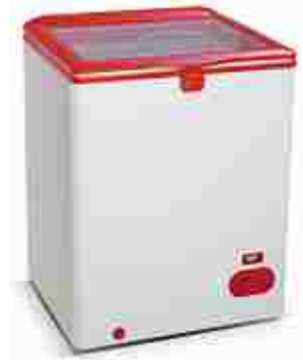
Top open glass door freezer 100L