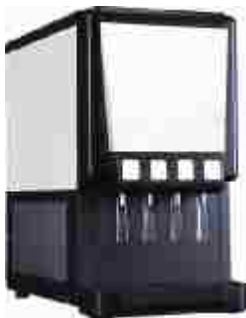
Pre-mix soda dispenser