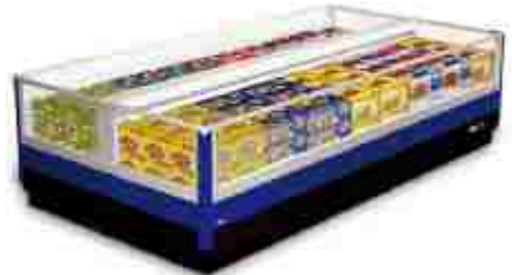
Arizona (remote type)