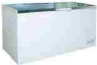
Stainless steel door 300/400/500/600L available

Chest freezer with UL and ENERGY STAR approval also available.