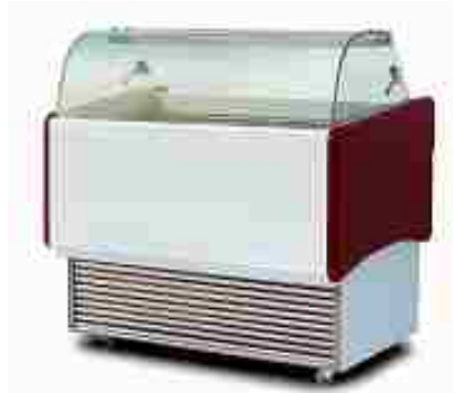
Static Cooling ice cream