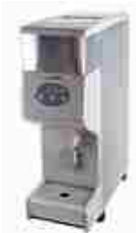
Ice dispenser ID12