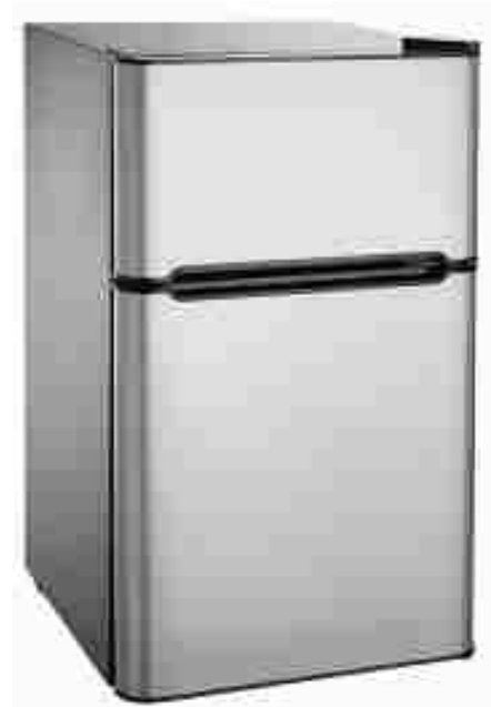
Mini Refrigerator BCD88