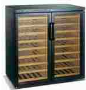
Absorption wine cooler