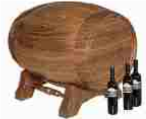
Countertop wine barrel