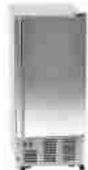
Outdoor ice maker