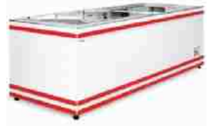
Flat glass CVS Freezer XS570