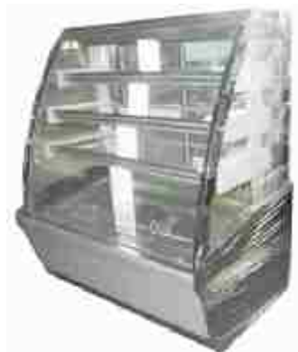
Three shelf double curve