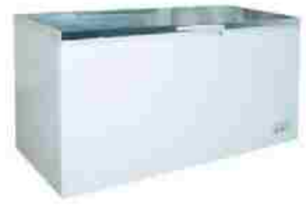
Solid door or Stainless steel door