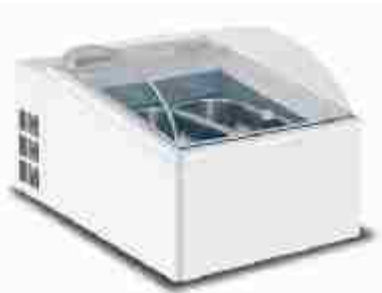
Countertop ice cream