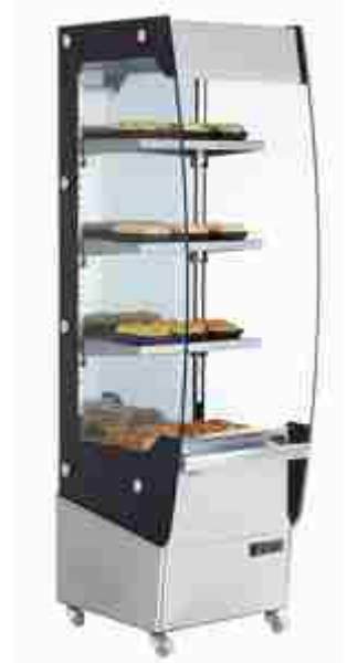
Optional Hot display

All kinds of 4 sided glass cooler can custom-made.