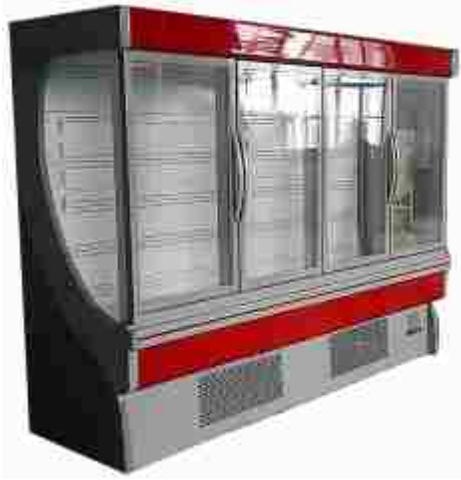
Upright Cooler K