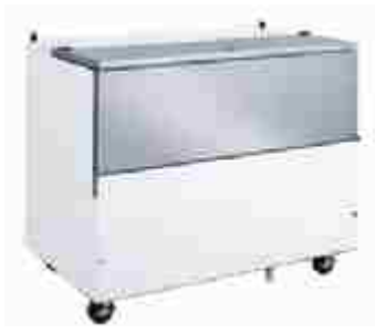
School Milk Cooler