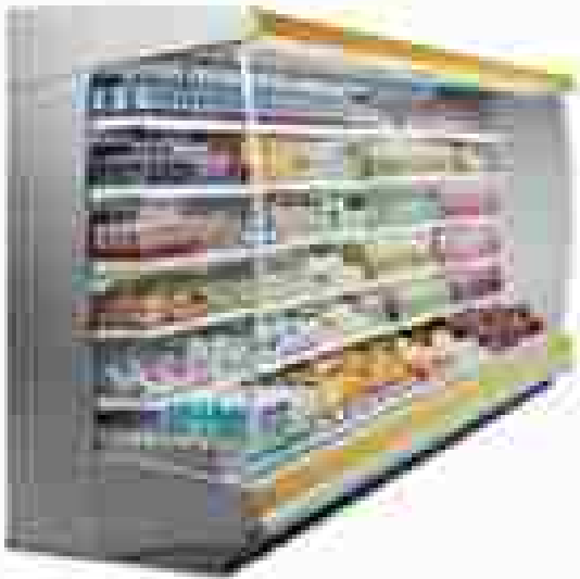
Florida (remote type)