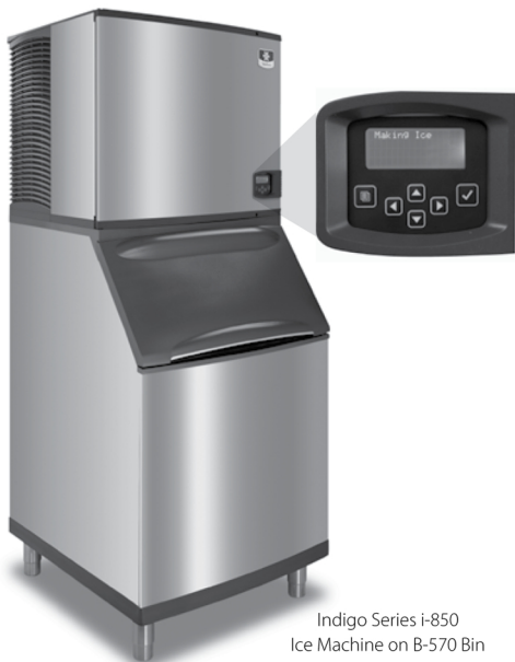
Indigo Series i-850 Ice Machine on B-570 Bin

Designed for operators who know that ice is critical to their business, the Indigo™ Series ice machine's preventative diagnostics continually monitor itself for reliable ice production. Improvements in cleanability and programmability make your ice machine easy to own and less expensive to operate.