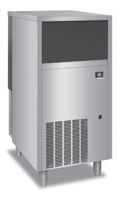
Model RF-0266A Flake Ice Machine