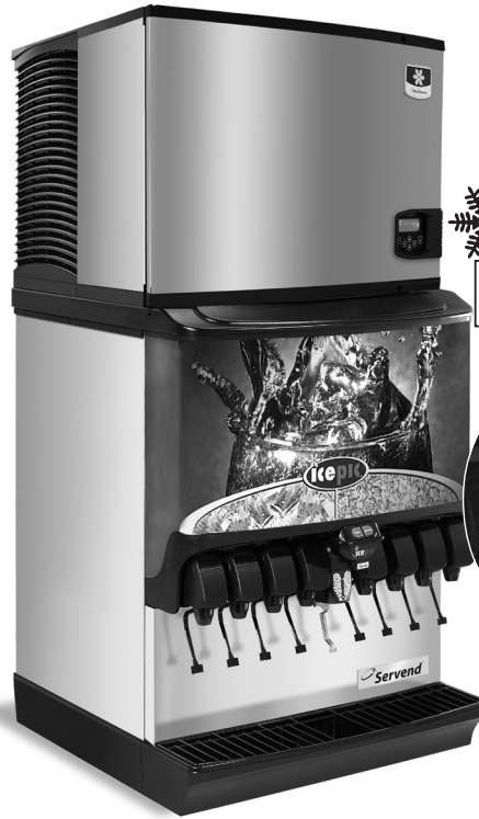
Selectable SV-250 Ice/Beverage Dispenser with Indigo Ice Machine