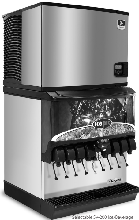
Selectable SV-200 Ice/Beverage Dispenser with S500 Ice Machine

SV-200 • SV-250 Selectable Ice/Beverage Dispensers with Ice Crusher