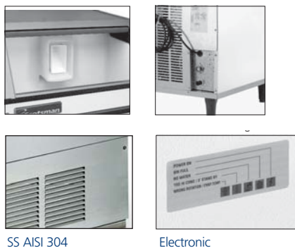
SS AISI 304