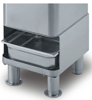
Optional trestle with sieve