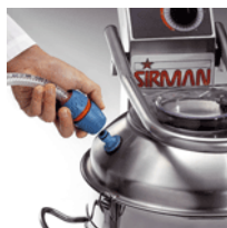
Fast connection/remove of water entry