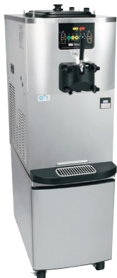
Optional Cart with front opening door