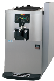
Optional Top Air Discharge Chute