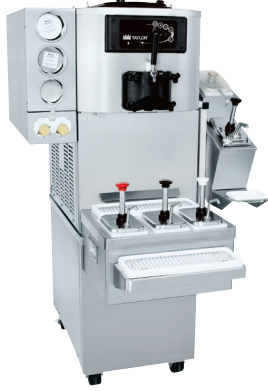
Optional Cart with rear door for front mount syrup rail