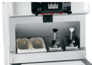
Integrated Syrup Rail Option - 2 room temperature with lids & ladles, 2 heated with syrup pumps